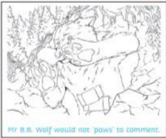
Mr B.B. Wolf would not 'paws' to comment.

Once inside, Riding Hood found her granny in her nightgown, tucked up in bed, apparently ill. However, after a short bout of questioning, Red soon realised