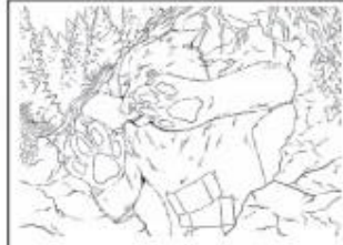
Mr B.B. Wolf would not 'paws' to comment.

Miss Riding Hood alleges that both she and her granny were gobbled whole by the cunning beast. "I found Granny alive, but very uncomfortable, inside the wolf's stomach," she told The Once Upon a Times.