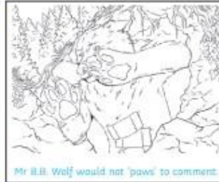
Mr R.R. Wolf would not 'paws' to comment.

Miss Riding Hood alleges that both she and her granny were gobbled whole by the cunning beast. "I found Granny alive, but very uncomfortable, inside the wolf's stomach," she told The Once Upon a Times.